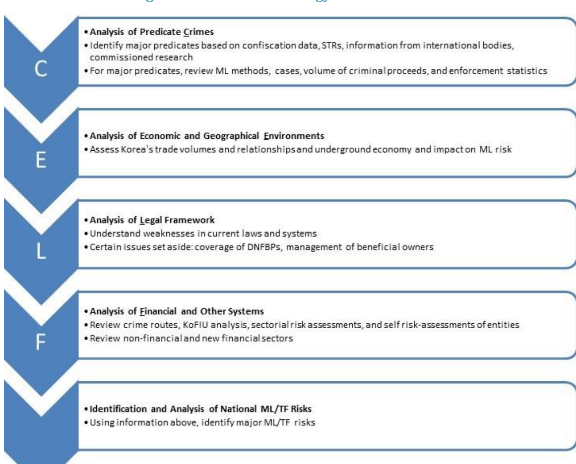
Figure 2.1. CELF methodology for the 2018 NRA

93. The 2018 NRA aimed to address earlier deficiencies. A joint committee of 12 government agencies developed the NRA, which ensured cross-government input and buy-in. The NRA identified risks based on qualitative and quantitative data provided by agencies and the private sector. Preliminary findings were then tested and further refined through discussions among the agencies to identify any gaps. The methodology for the 2018 NRA was broad, employing a "CELF" approach (see Figure 2.1 that considered a wide range of relevant factors to come to an overall risk assessment. The outcomes of the 2018 NRA are consistent with the 2014 and 2016 NRAs in most areas (e.g. the identification of tax crime and fraud as prominent risks) despite the shortcomings in the previous NRAs' processes. Nonetheless, the NRAs also show an evolution in Korea's risk understanding, which reflects its efforts to refine and improve the methodology across each NRA. For example, the 2018 NRA newly identifies the emerging threat of virtual assets.