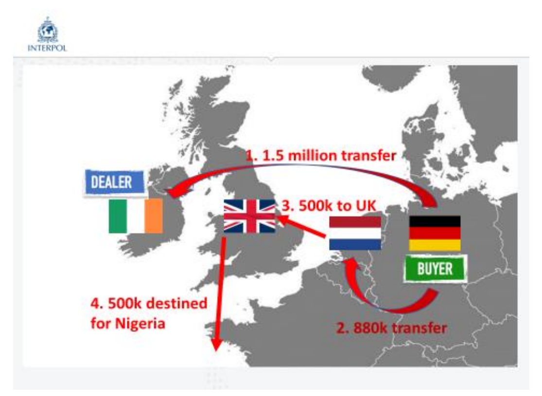
Figure 1. International COVID-19 Scam

Examples submitted by jurisdictions suggest that schemes involving the sales of counterfeited medical goods, or non-delivery scams, can be both domestic and international in nature – such as the multination case above [Case Study 2] or the domestically focused case below [Case Study 3]. These scams may involve personal protective equipment, pharmaceutical products or other types of medical equipment, for which there has been a substantial increase in demand.